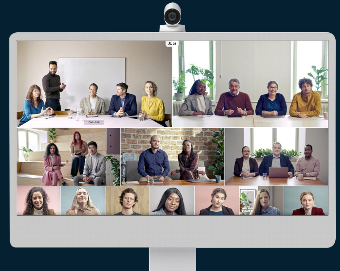
With Adaptive Composition, Pexip is the first to bring AI-powered auto-framing and intelligent layout to any meeting participant

To keep you up-to-date with all relevant information, please opt in for company and investor news through our website http://investor.pexip.com .