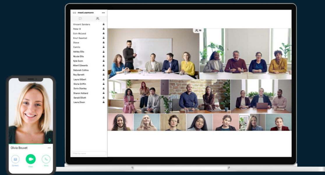
Pexip Infinity Connect Application